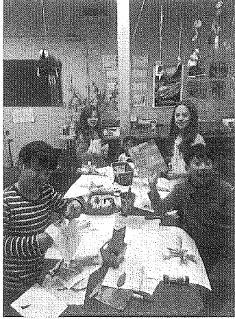
Campers having fun and being artistic at Emerging Artists Day Camp

Do you have any plans for Spring Break? Join our fun day camps at Langley Centennial Museum (9135 King Street, Fort Langley). Emerging Artists Day Camp will be held March 14-18, 9:00am-3:00pm and is $166.25. Pioneer Pastimes Day Camp is new this year, and will be held March 21-24, 9:00am-3:00pm and is $133 for the week. Get creative and explore the world of arts and heritage by sparking your creativity, imagination and using problem-solving skills to learn 5 Call 604.532.3536 for details or visit museum.tol.ca